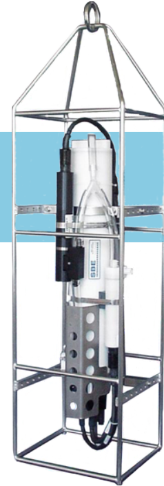
SHOWN WITH OPTIONAL CAGE, SBE 5P PUMP, & SBE 43 DO SENSOR